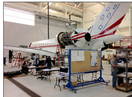
Tempus Jets' Part 145 Repair Station in Hangar 6.